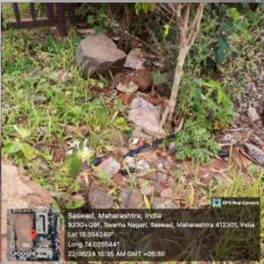
Utilization of conserved and harvesting water for gardening